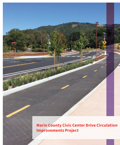
Marin County Civic Center Drive Circulation Improvements Project